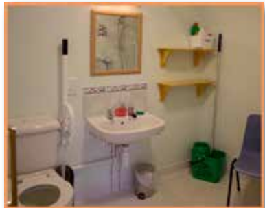
Wet room in Tamworth