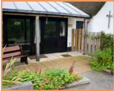
Pig Pen patio