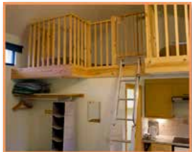
Sky cots (Berkshire & Gloucester)